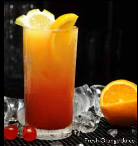
Fresh Orange Juice